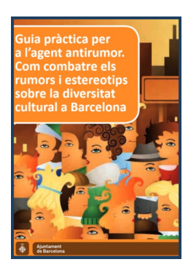
A pamphlet from Barcelona's antirumor campaign

See: citiesofmigration.ca/good_idea/the-dilemma-workshop/